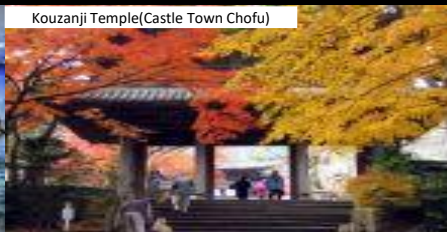
Kouzanji Temple(Castle Town Chofu)