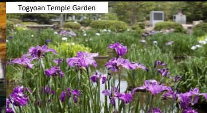
Togyoan Temple Garden