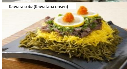
Kawara soba(Kawatana onsen)