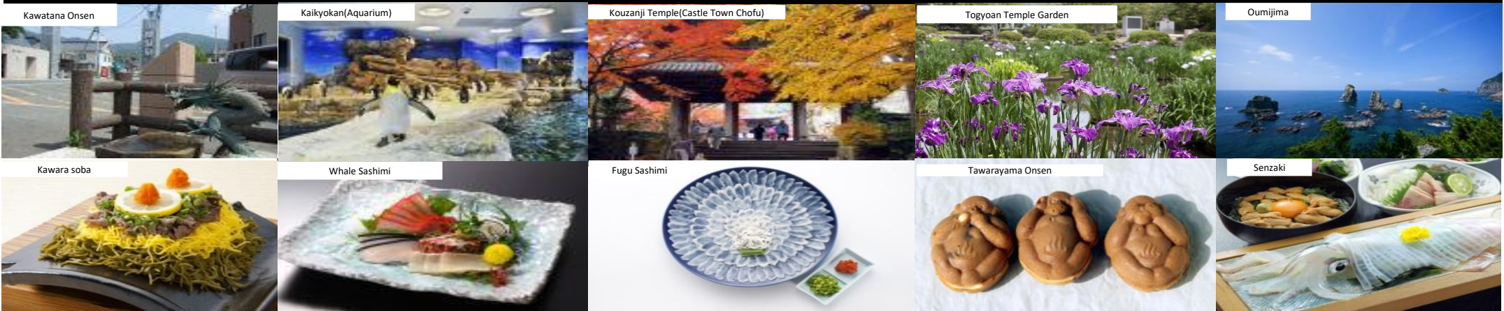
Kawatana Onsen Kaikyokan(Aquarium) Kouzanji Temple(Castle Town Chofu) Togyoan Temple Garden Oumijima Kawara soba Whale Sashimi Fugu Sashimi Tawarayama Onsen Senzaki